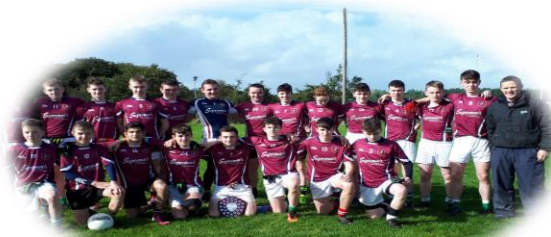
Flanagan Cup Winners, Senior Boys